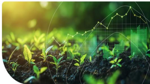
Keeping the lid on carbon emissions