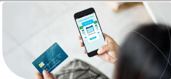
Revenue assurance in the age of subscriptions: Why data matters more than ever