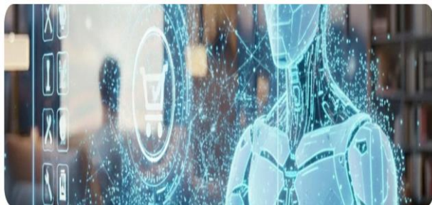
Agentic Commerce is Redefining Retail—Here's How to Respond