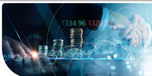
No regulatory backing but stablecoin use steadily rising in India