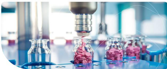
Recalibrating Pharma after the GST Overhaul