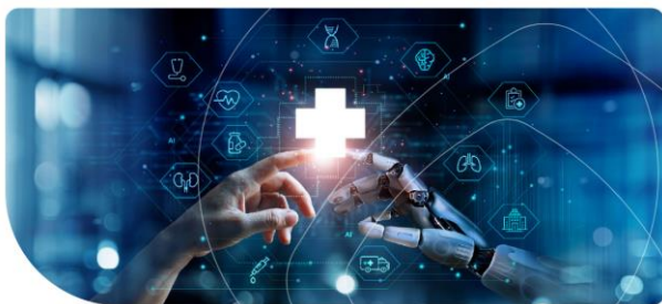
AI and robotics led transformation in healthcare and life science