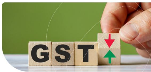
GST 2.0 simplifies tax structure, unlocks new opportunities for CFOs